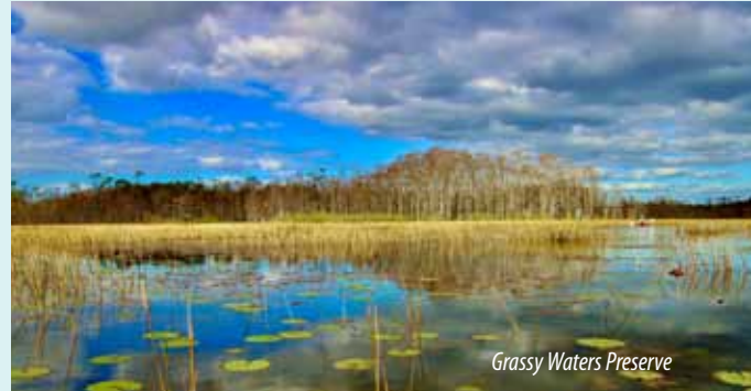
Grassy Waters Preserve

The City also acquired approximately 99.3 million gallons of finished drinking water from the Palm Beach County Public Water System (#4504393) during 2022 through interconnections.