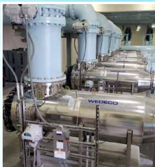
Ultra-Violet (UV) Treatment System

Later in 1955, the City of West Palm Beach purchased the Water Treatment Plant from Henry Flagler's family, and continued to invest in further development until 1988, when the Plant capacity topped off at 47 million gallons per day. In February of 2019, the Water Treatment Plant started up the new Ultra-Violet (UV) treatment system that established an additional barrier to